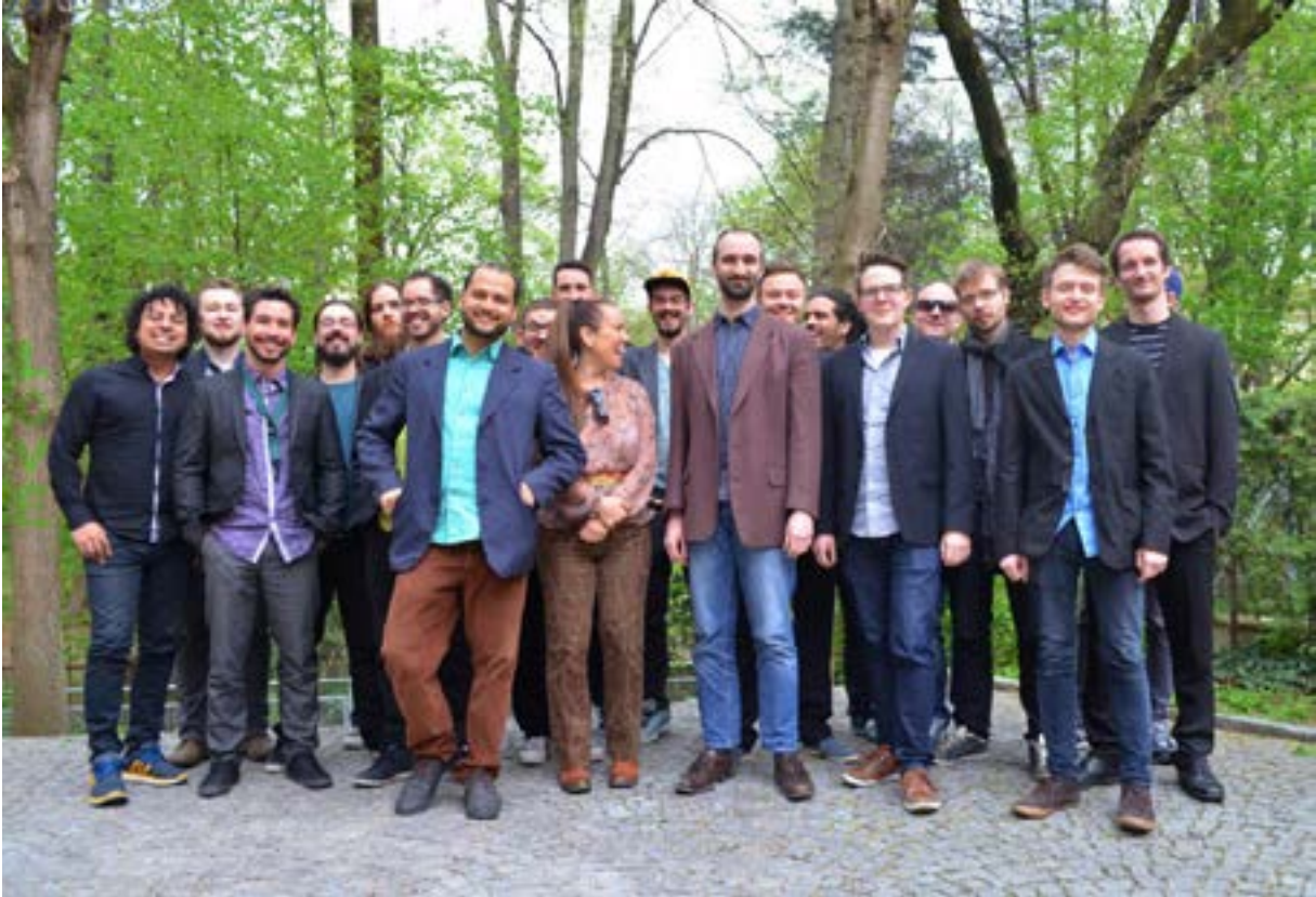
VIDEO (Click on the Pic)